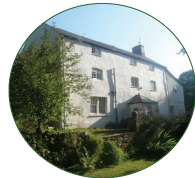
Church Farm Guesthouse