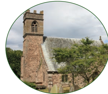
Church of St Michael and All Angels