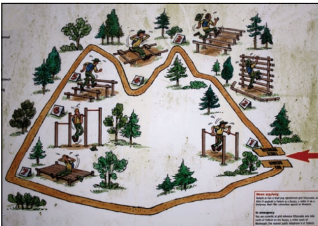
Trim trail map by car park

Interspersed along the main track is a Trim Trail consisting of various wooden adventure structures, such as a gate climb and stride jumps, that most age groups will enjoy. Dog walkers are asked to be aware of runners and other users of the Trim Trail and to ensure that their dogs do not foul the safety chippings beneath the structures.