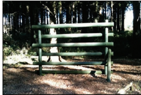
Climbing gate on Trim Trail

From the car park (1) turn right along the forest road with mainly Larch trees to the left and Douglas Fir on the right. There are at least a dozen different tree species along the route. Why not bring a tree identification book along with you? Children can have fun collecting all the different leaves.