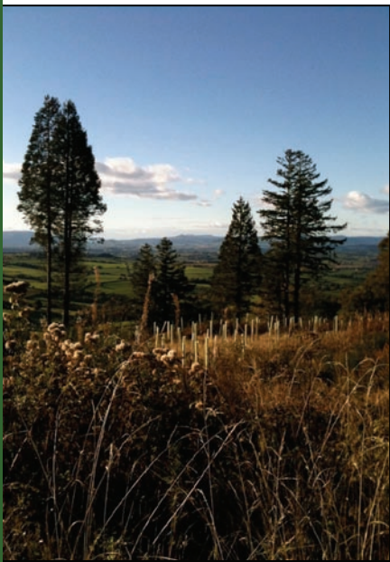
Black Mountains from Loysey Wood

to the right and look out for fallow deer as you keep straight on. Do not take the wide left turn at (5) just yet.